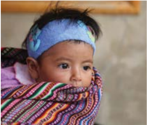
Doterra Healing Hands Foundation is a US chaity. EIN Number: 27-2840005

For more information, please visit www.doterrahealinghands.org