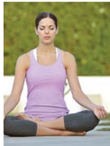
JUNIPER BERRY ESSENTIAL OIL SEE PAGE 12