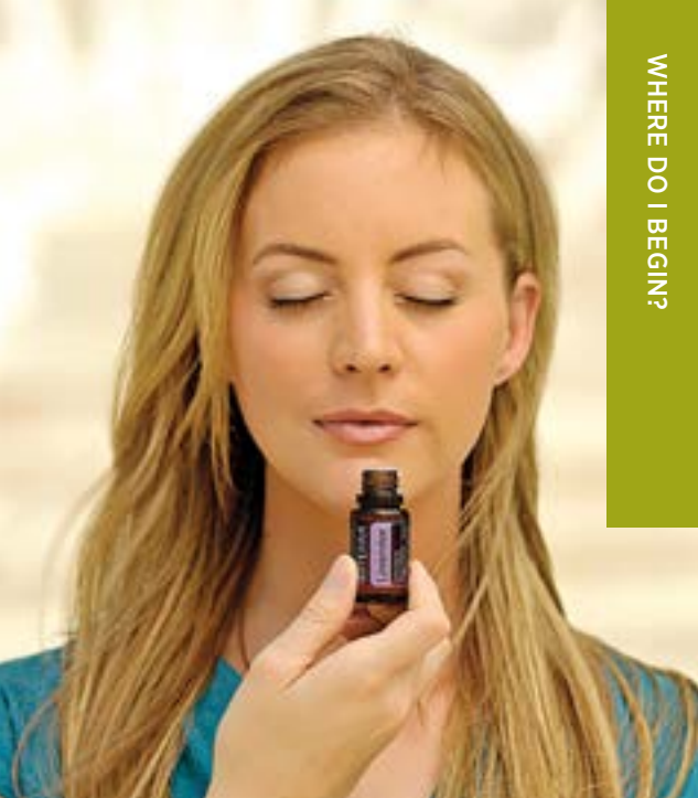
WHERE DO I BEGIN?